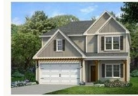
FRONT ELEVATION Argyle SB