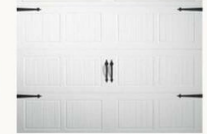
GARAGE DOOR 430 Grooved