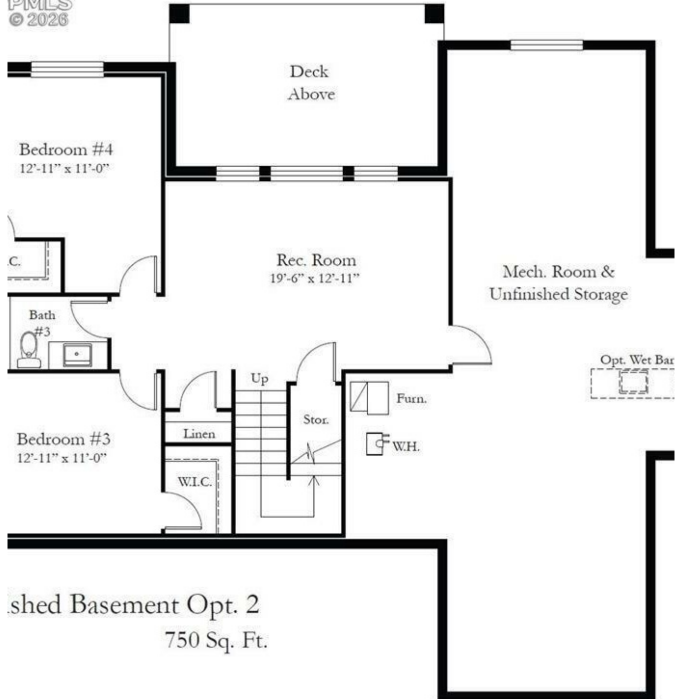
Finished Basement Opt. 2 750 Sq. Ft.