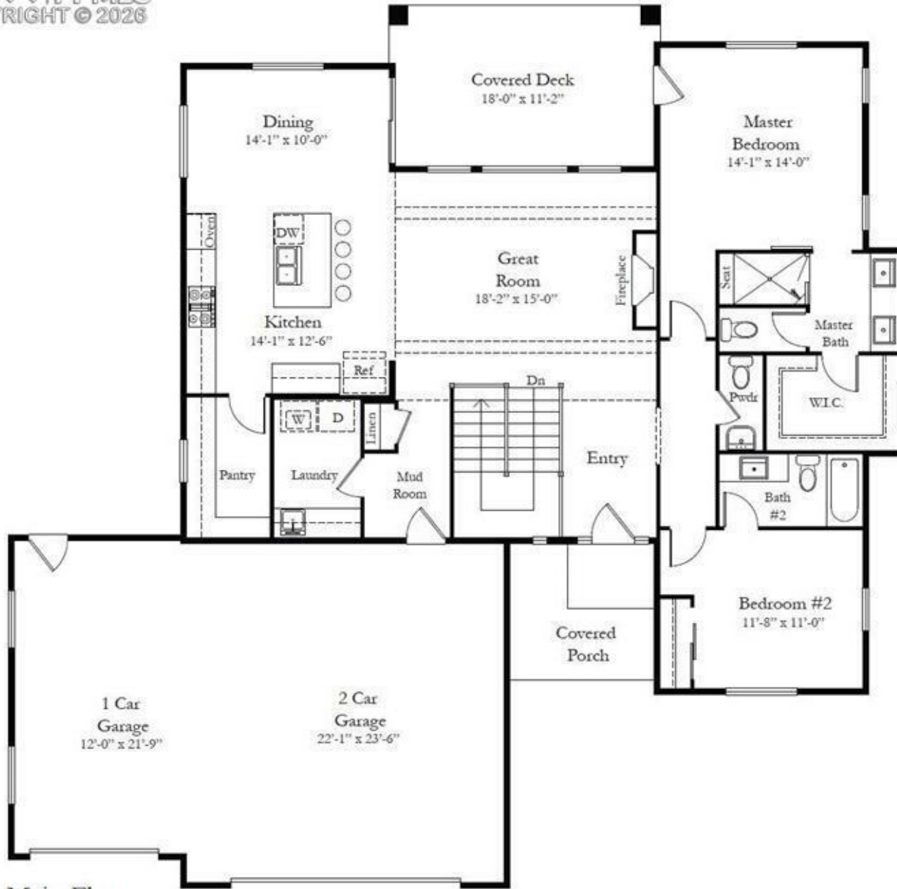
Main Floor 1,695 Sq. Ft.