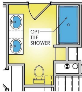
OPT TILE SHOWER