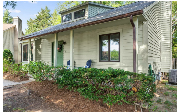
Main Floor Finished Area 1229.43 sq ft